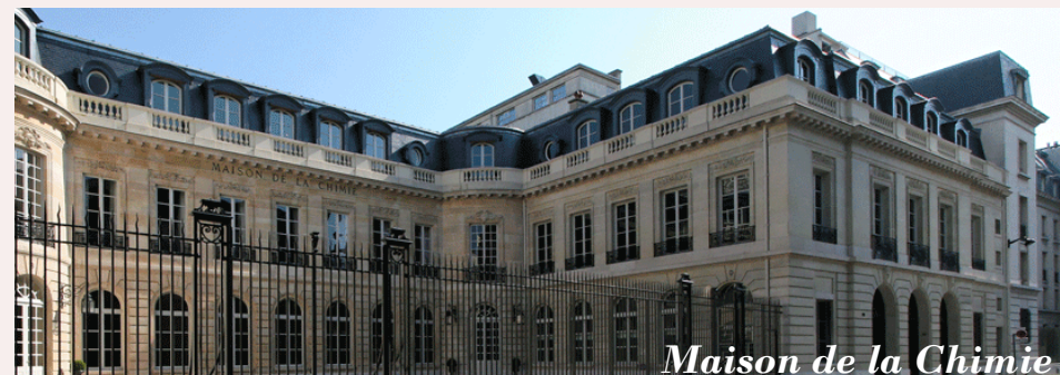
Maison de la Chimie